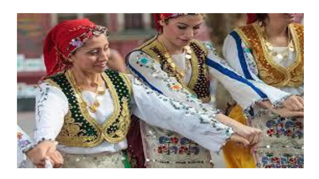
Day 12: Wednesday, October 29, 2025

After breakfast we travel to Istanbul. Tea break at Camlica Hill , with breathtaking view of the city. Visit majestic Dolmabahce Palace (residence of latter-day Sultans of the Ottoman Empire). Dinner and overnight in Istanbul .