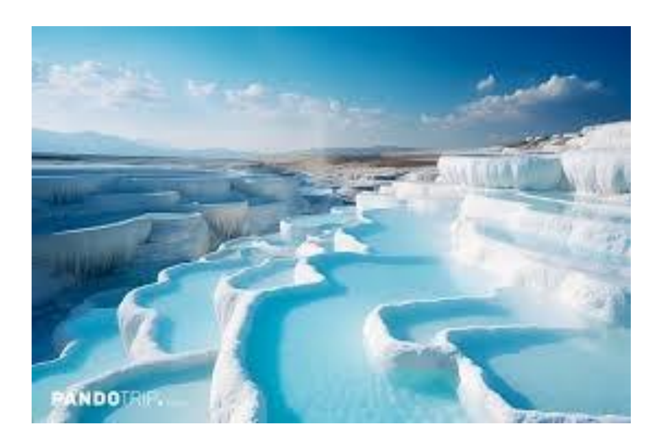
Day 7: Friday, October 24, 2025

After breakfast drive to the Greco-Roman settlement of Aphrodisias , dedicated to Goddess of Love. In the afternoon visit the House of Virgin Mary . Dinner and overnight in Kusadasi .