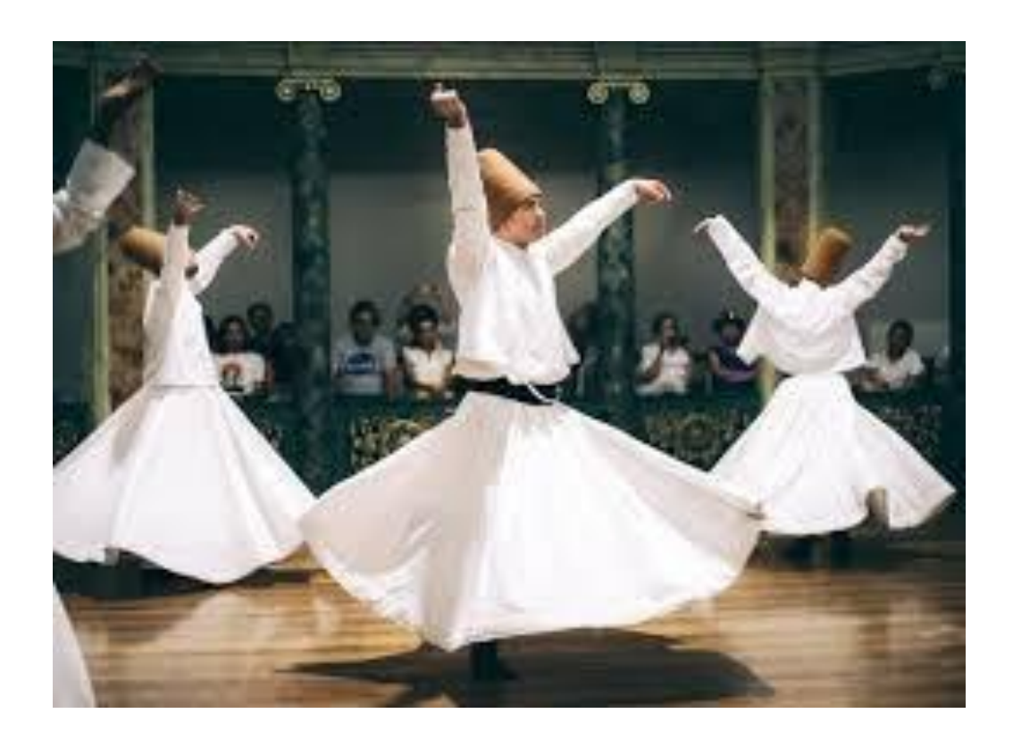
Day 6: Thursday, October 23, 2025

After breakfast stop by Sultanhan caravanserai en route. Drive to Konya and visit the famous Mausoleum of Mevlana . Dinner and overnight in Konya .