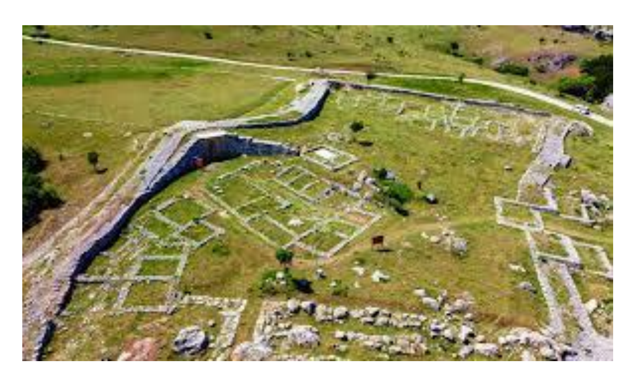
Day 4: Tuesday, October 21, 2025

After breakfast travel to the historic Hittite capital of Hattusas and visit the Temple, Underground Gate, Citadel and Sanctuary of Yazilikaya . Continue to the Pre-Hittite town of Alacahoyuk and visit the graves of the kings. Drive to fascinating Cappadocia. Dinner and overnight in Cappadocia .