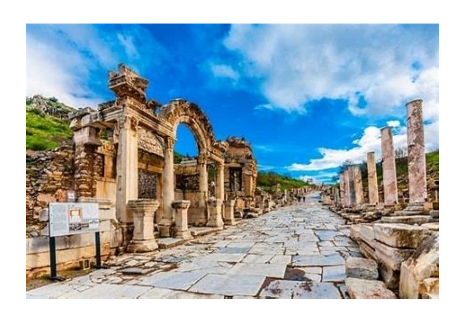
Day 8: Saturday, October 25, 2025

After breakfast drive to the Greco-Roman settlement of Aphrodisias , dedicated to Goddess of Love. In the afternoon visit the House of Virgin Mary . Dinner and overnight in Kusadasi .