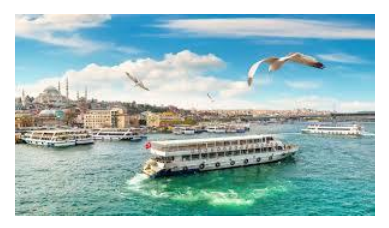
Day 14: Friday, October 31, 2025 After breakfast make your own way to the airport for flight home.

After breakfast drive to the Grand Bazaar , a maze of over 4000 tiny shops selling gold, jewelry, leather work and fine carpets, and the exotic Spice Bazaar . We'll take a scenic cruise on the Bosphorus . En route we'll pass palaces, castles, palatial homes etc. Dinner and overnight in Istanbul .