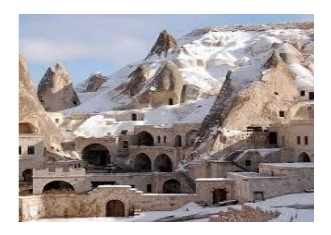
Day 5: Wednesday, October 22, 2025

After breakfast stop by Sultanhan caravanserai en route. Drive to Konya and visit the famous Mausoleum of Mevlana . Dinner and overnight in Konya .