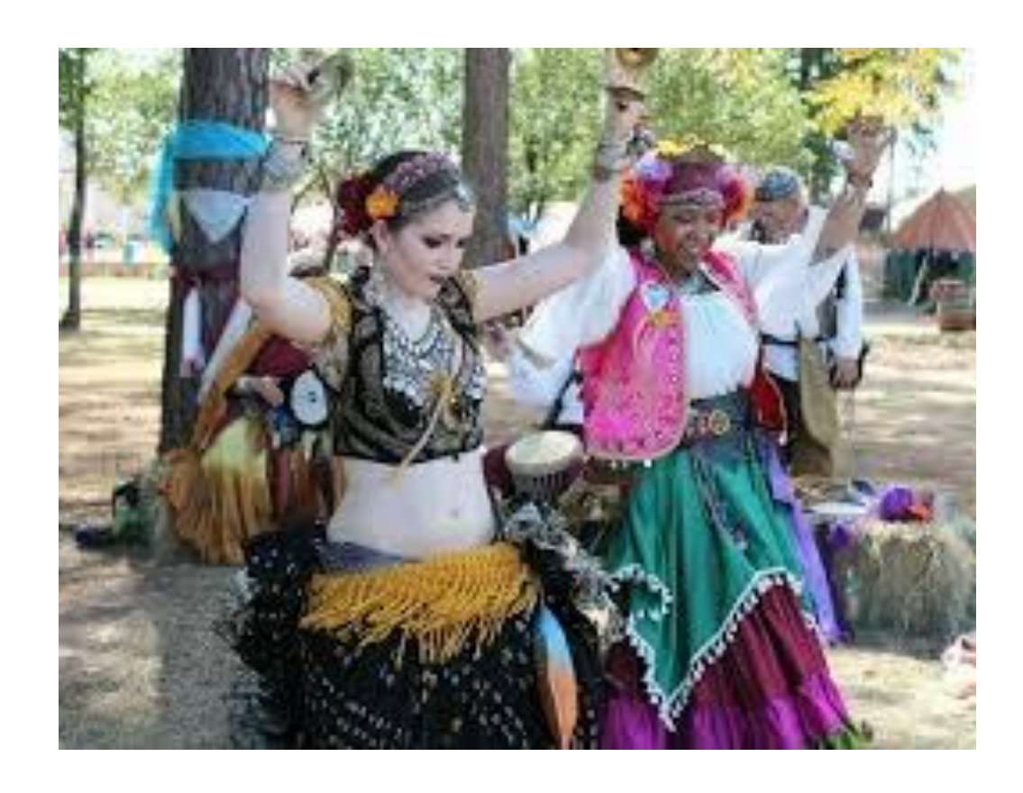
Day 9: Sunday, October 26, 2025 After breakfast drive to Pergamum. Visit this ancient capital, its healing Asclepium, and the dramatic Acropolis. Dinner and overnight in Canakkale.